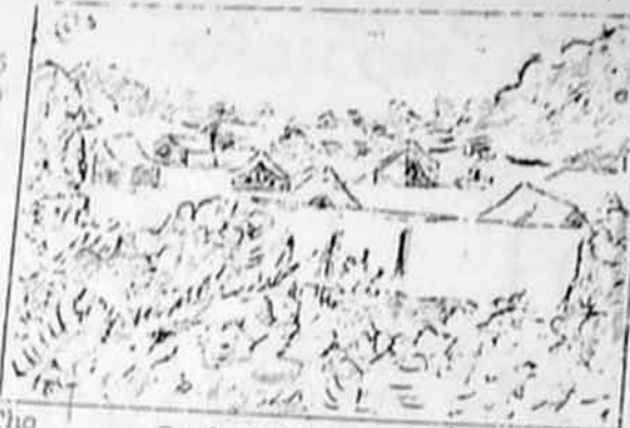
THE TENT CITY